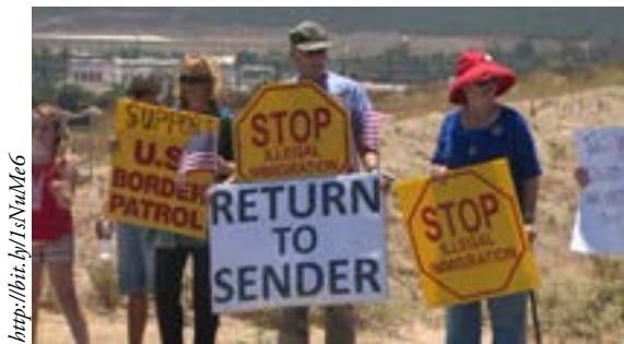
Protestors in Murrieta, California

A humanitarian crisis is erupting in the United States where thousands of refugee children are seeking asylum from dangerous conditions in Central America. Unfortunately, they are not welcome in the U.S. In places such as Murrieta, California, and Oracle, Arizona, the message is clear: Thousands of immigrant children fleeing Central America are unwelcome in Small Town U.S.A.